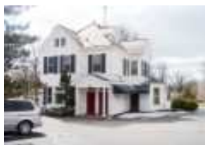
Beyond Hearing Aids

Beyond Hearing Aids, Inc. 463 Erlanger Rd. Suite 1 Erlanger, KY 41018