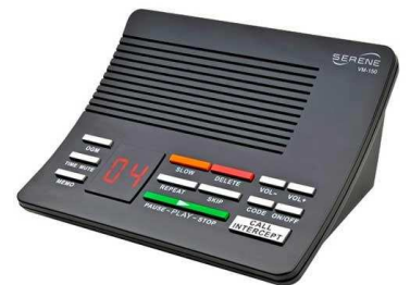
Serene Innovations Amplified Answering Machine HC-VM150 $79.95

We have tested three answering machines this year and the Serene Innovations Amplified Answering Machine is the standout winner! Other machines we tested lacked the clarity of speech that Serene Innovations has in the incoming recorded messages. It was difficult to understand messages the callers left on the other two machines. All three machines that we tested feature variable playback speed, which is very useful for someone with hearing loss. One has good playback speed adjustment, another has no discernable change in speed. Serene Innovations has three playback speeds: Normal, Slow 1, and Slow 2. We might like to see a little more adjustment available on speed of playback, but the three speeds should be adequate for most users. One of the other machines we tested we found difficult to use. We found the Serene Innovations answering machine to be easy to use. It has a 3.5mm headset jack so you can listen with a headset, or use a telecoil neckloop with your telecoil equipped hearing aids.