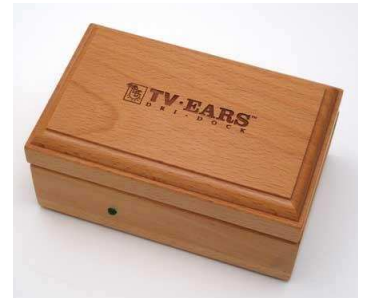
TV Ears Dri-Dock Electronic Hearing Aid Dryer TVEARS-DRIDOCK $59.95

It was a great economical hearing aid dryer that had a simple wood cabinet and held two hearing aids of any size . It never needed desiccant or replacement bulbs. The Moisture Guard is no longer available (p. 65 in the catalog), but we still get calls about it. We want you to know that TV Ears makes a product that is nearly identical and is the same price, with a similar one year warranty. This hearing aid dryer is a great choice for vocational rehabilitation counselors to order for their