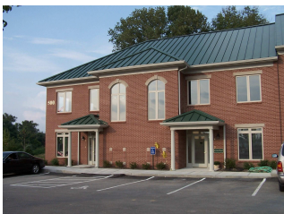
Beyond Hearing Aids

Beyond Hearing Aids, Inc. 6900 Houston Road Bldg. 500, Suite 3 Florence, KY 41042