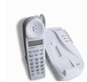
Clarity C600 Cordless Phone AMER-C600 - $189.95

The Clarity C600 has a 2.5mm headset jack. You can use a neckloop but order it separately.