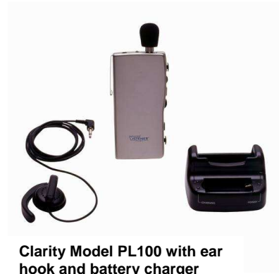
Clarity Model PL100 with ear hook and battery charger AMER-PL100 - $149.95