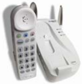
Clarity Cordless Phone C4205