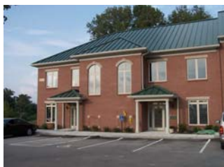
Beyond Hearing Aids

Beyond Hearing Aids, Inc. 6900 Houston Road Bldg. 500, Suite 3 Florence, KY 41042