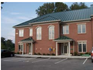
Beyond Hearing Aids

Beyond Hearing Aids, Inc. 6900 Houston Road Bldg. 500, Suite 3 Florence, KY 41042