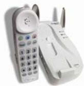
Clarity Cordless Phone C4205