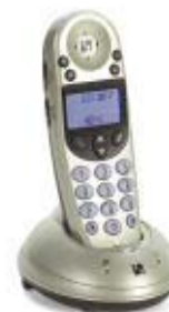
Clearsounds A50 cordless phone

The new Clearsounds A50 amplified cordless phone has all the features many people want, 50 dB gain, caller-ID and sleek looking design. We have shipped several of these and have found that there are problems with a few. We will be testing any other phones we send out until we know they are stable. It's disappointing that there are problems, but we remain hopeful.