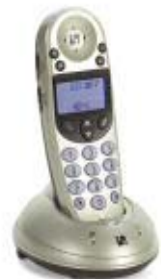
Clearsounds A50 cordless phone

The new Clearsounds A50 amplified cordless phone has all the features many people want, 50 dB gain, caller-ID and sleek looking design. We have shipped several of these and have found that there are problems with a few. We will be testing any other phones we send out until we know they are stable. It's disappointing that there are problems, but we remain hopeful.